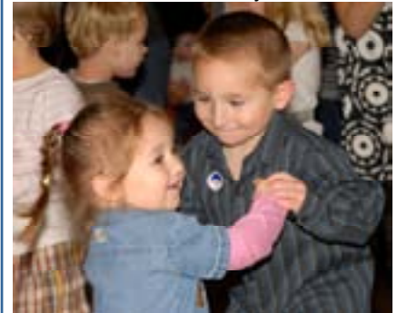
Winter Wonderland Party