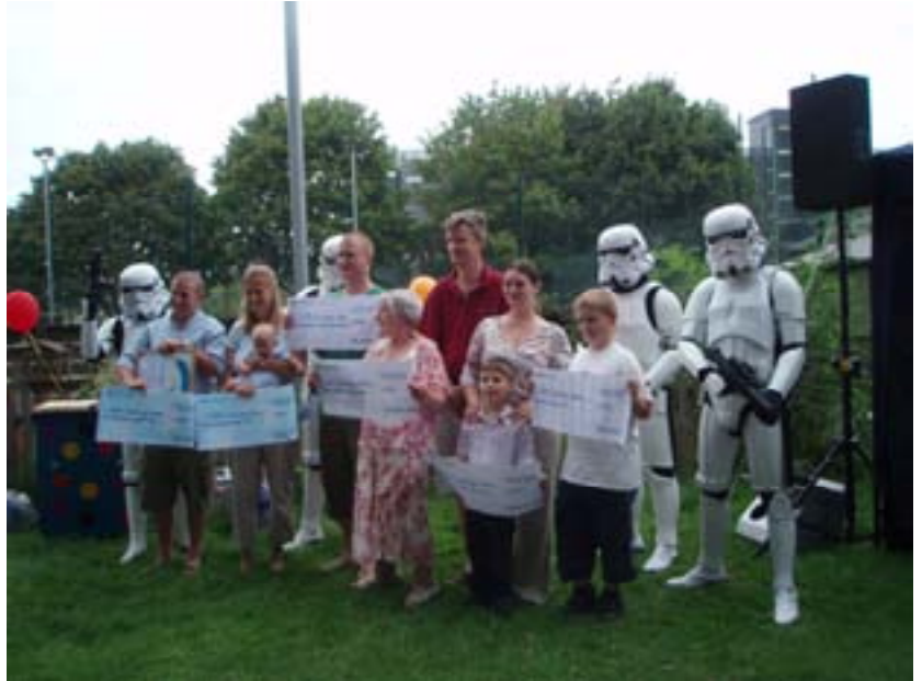
Cheques presentation at the Summer Party 2008.